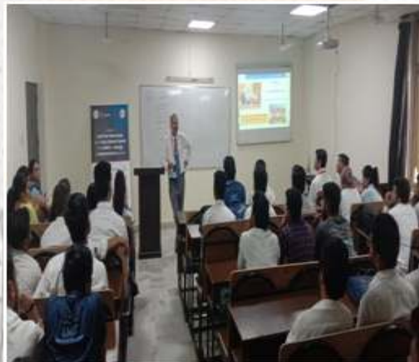
Students Attending the Session