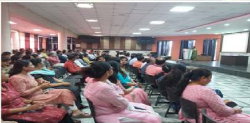
Teacher's Day Celebration in Progress