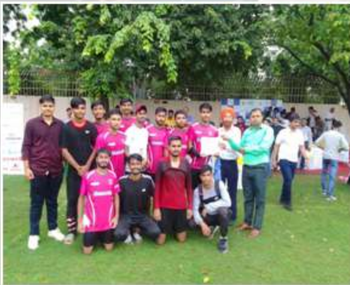
IIMT Students At The Tournament Venue